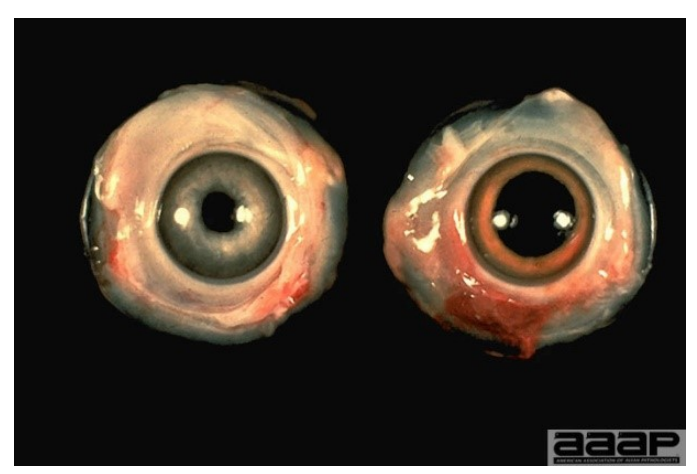
Marek's Disease affected eye (picture on left)