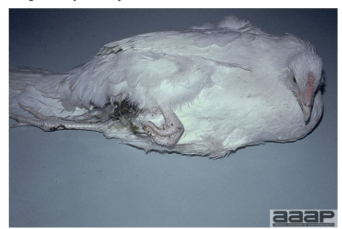
Paralyzed chicken with Marek's Disease

The symptoms of Marek's Disease depend on which tissues are attacked. In the classic form, Marek's Disease will cause inflammation and tumors in the nerves, spinal column and brain. In this form, birds will become paralyzed in the legs, or wings or may develop head tremors.